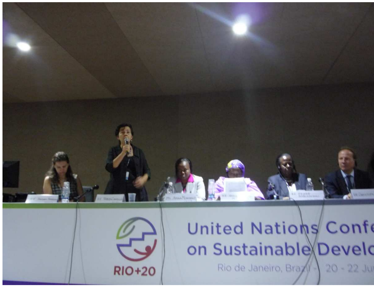
United Nations Conference on Sustainable Development, Brazil.