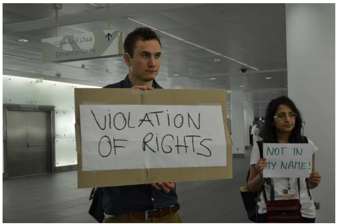
Participants in an action led by Women and Gender NGOs at COP18 in Doha, Qatar, decrying the lack of sincere and effective actions on the part of the countries from the Global North.

Furthermore, current mitigation strategies are often based on market or payment-related mechanisms which lack a gender or long-term social justice perspective. For example, the current promotion and use of biofuels has been taken forward without gender and environmental analyses that might have predicted their high social cost when they compete with food crops or are grown for industrial uses that do not contribute to development of the local community; and that their production can be just as bad for the climate when full lifecycle emissions are taken into account. Other mitigation strategies that prioritize carbon sequestration may also affect the relationship between women, especially indigenous women, and the forest, especially if access to traditional territories is restricted or banned for conservation purposes.<sup>167</sup> Many such strategies fail to prioritize local community benefits or consider the implications for women in terms of unequal land tenure rights. Ultimately they are likely to reduce access to forest resources, include water, food, fuel and other resources necessary for sustainable livelihoods.