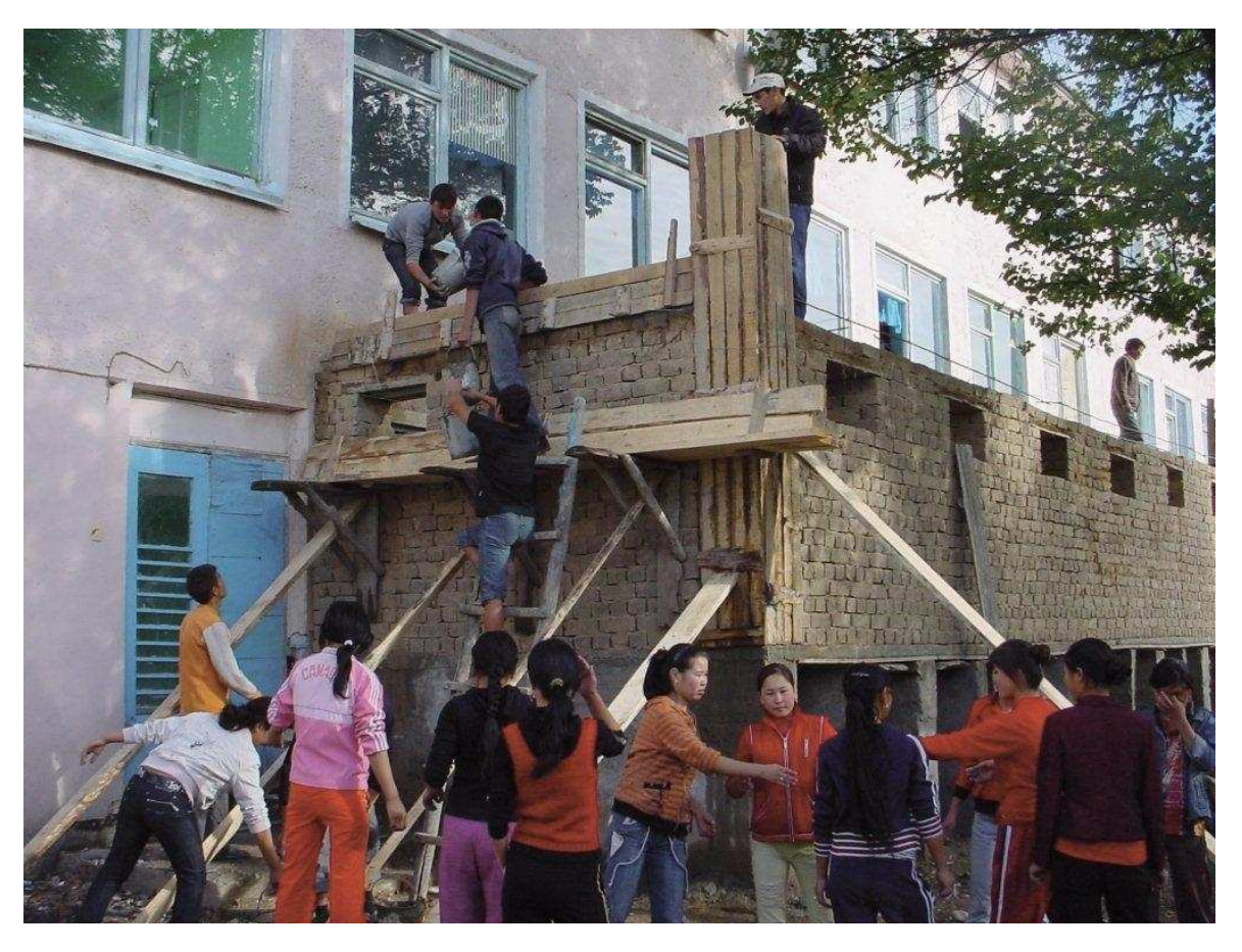
Women implementing energy saving measures at a school in Kyrgyzstan, by building solar collectors and training on sustainable insulation methods.

When asked, most people don't want to put their money into activities which kill other people, or which destroy their own health or environment. Nevertheless, almost all of us do. When analysing the investments of the major retirement funds, these funds invest in companies that are directly linked to undesirable products and processes, such as the tobacco industry, oil, gas, mining, uranium, pesticides and even arms. The investment and banking sector is probably the main driver for unsustainable development and indirectly, human rights abuse. At the same time, financial speculation with commodity prices has increased the number of hungry people in the world<sup>32</sup>. The extractive industry sector and the chemical industry sector have made there greatest profits ever last year, in the middle of the financial crisis, with the largest corporations making 30-50 billion profits per company in one year, even though they are responsible for among the greatest environmental harm in the world, - and in most cases they are not paying for the damage and clean-up. Clearly our financial system is a barrier to a sustainable and equitable economic system. Governments need to re-regulate corporations and the banks, going well beyond the first steps taken by the EU on bankers' bonuses.