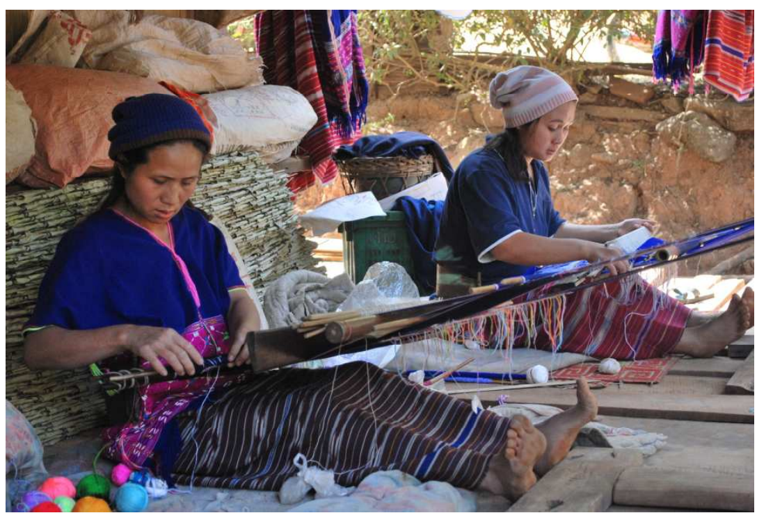
Traditional cloth weaving, Thailand. Photo: Indigenous Peoples' Biocultural Climate Change Assessment Initiative. See http://ipcca.info.

The SPF-Initiative is both fair and feasible. ILO studies show that it is globally affordable at virtually any level of economic development, even if less developed countries need international support to implement it gradually. For example, El Salvador, Benin, Mozambique and Vietnam could provide a major social protection floor for as little as 1-2% of their Gross Domestic Product (GDP); and Burkina Faso, Ethiopia, Kenya, Nepal, Senegal and Tanzania could provide a universal basic pension for just over 1% of their GDP. In Brazil, the conditional cash transfer 'Bolsa Familia' already covers 46 million people, at a cost just 0.4% of its GDP.