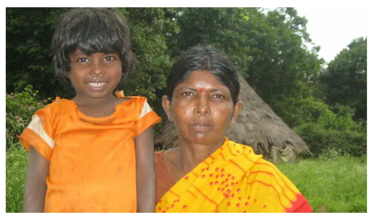
Chenchu mother and daughter, Andhra Pradesh, India.

The third issue to be addressed is the paradox of systematic undervaluation of care and discrimination against those who provide care in economic systems that rely heavily on unpaid work provided mainly by women. Not only does such unpaid work sustain and reproduce the labour force through its nourishment and care, but it also absorbs the 'invisible' costs of poor infrastructure and service provision when governments are unable to provide them. Such costs are manifested for example in the time devoted (mostly by women and girls) to fetch water or collect wood or other sources of fuel in rural and poor urban areas where services are not provided. Effects of climate change, ecological damage and extreme weather conditions further exacerbate such tasks. The dimensions of the unpaid economy should not be underestimated, as an increasing number of household satellite accounts continue to prove that it is comparable to the main economic sectors for most societies.<sup>240</sup>