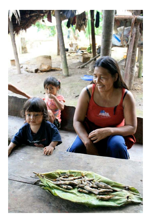
Sapara woman, Ecuador. Photo: Indigenous Peoples Biocultural Climate Change Initiative. See http://ipcca.info

Women's rights have been severely curtailed by the industrialisation of agriculture. The Green Revolution of the 1960s exposed small and landless farmers across the South, especially in Asia, to a wide range of negative social and ecological conditions, and compounded the exploitation experienced by women under existing feudal and patriarchal systems. Subsequent trade liberalization policies imposed on developing countries have exacerbated the situation, putting small and landless farmers, especially women farmers, at risk in multiple ways. The current economic, ecological and food crises are now pushing women and their families to the limit, with the starkest impacts being felt by the poorest, hungriest households.