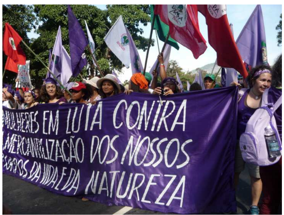
Women protesting against the commercialization of life at the Rio+20 Summit.