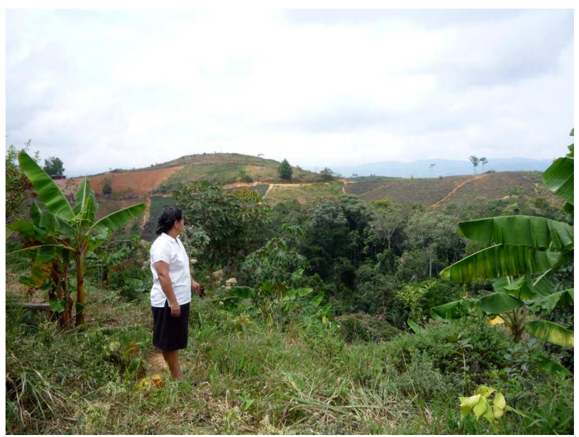
Woman from an agroecology farm in Lebrija-Santander, an area heavily affected by pineapple monocultures, where the community, including women's groups, have gathered together to restore the ecosystem by using traditional practices and using environmentally friendly techniques. Colombia.