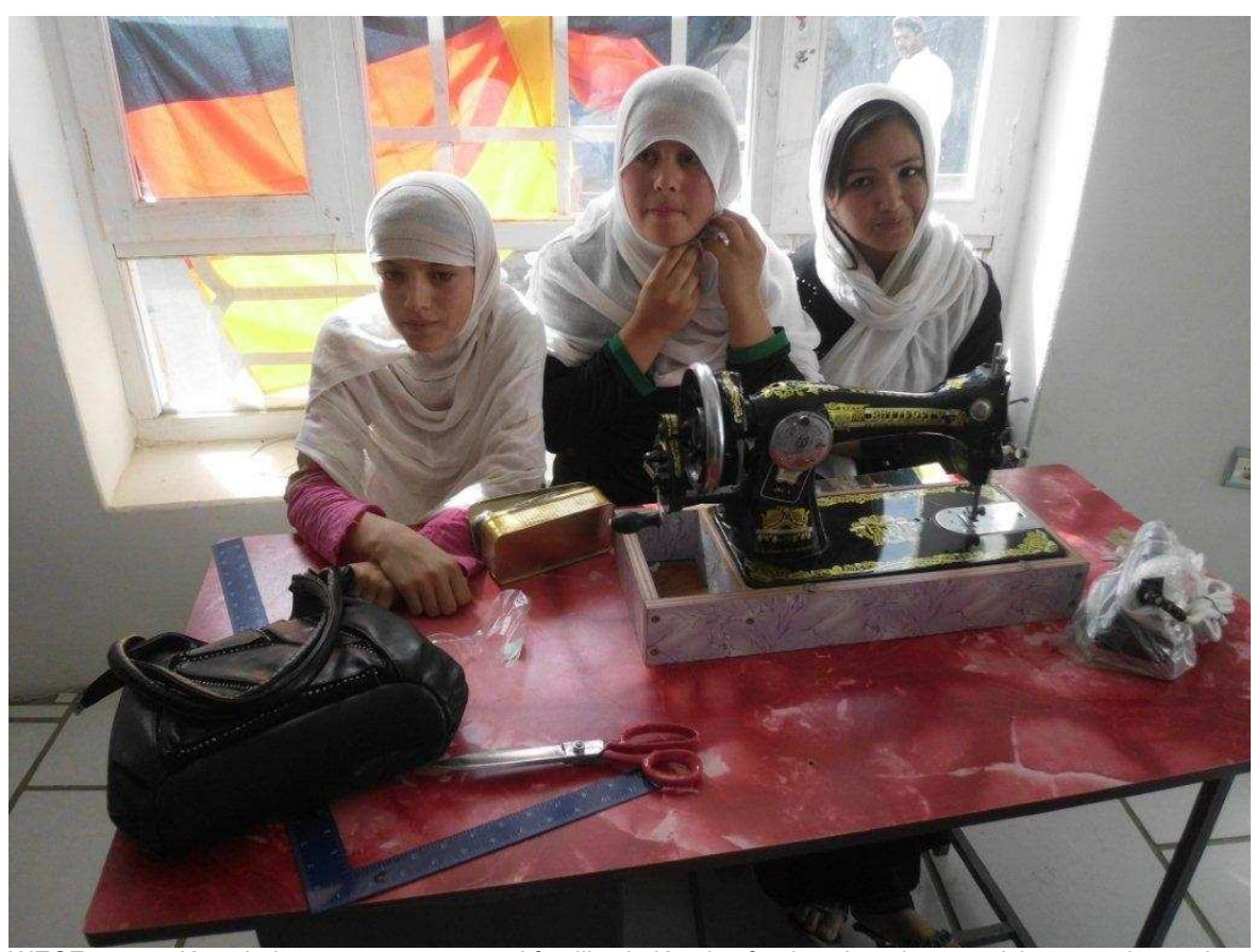
WECF partner Katachel prepares women and families in Kunduz for the winter by organizing a sewing project in Kunduz, Afghanistan.

As mentioned above, gender discrimination in social and economic roles also exacerbates women's environmental vulnerability. Women are at a higher risk from and are disproportionately affected by climate change and environmental degradation, because they have access to fewer resources — including land, credit, agricultural inputs, technology and training services, and participation in decision-making bodies — and this impedes their ability to avoid or adapt to various situations. The lack of basic social protection increases women's dependency on natural resources and decreases the likelihood that they can overcome environmental distress.