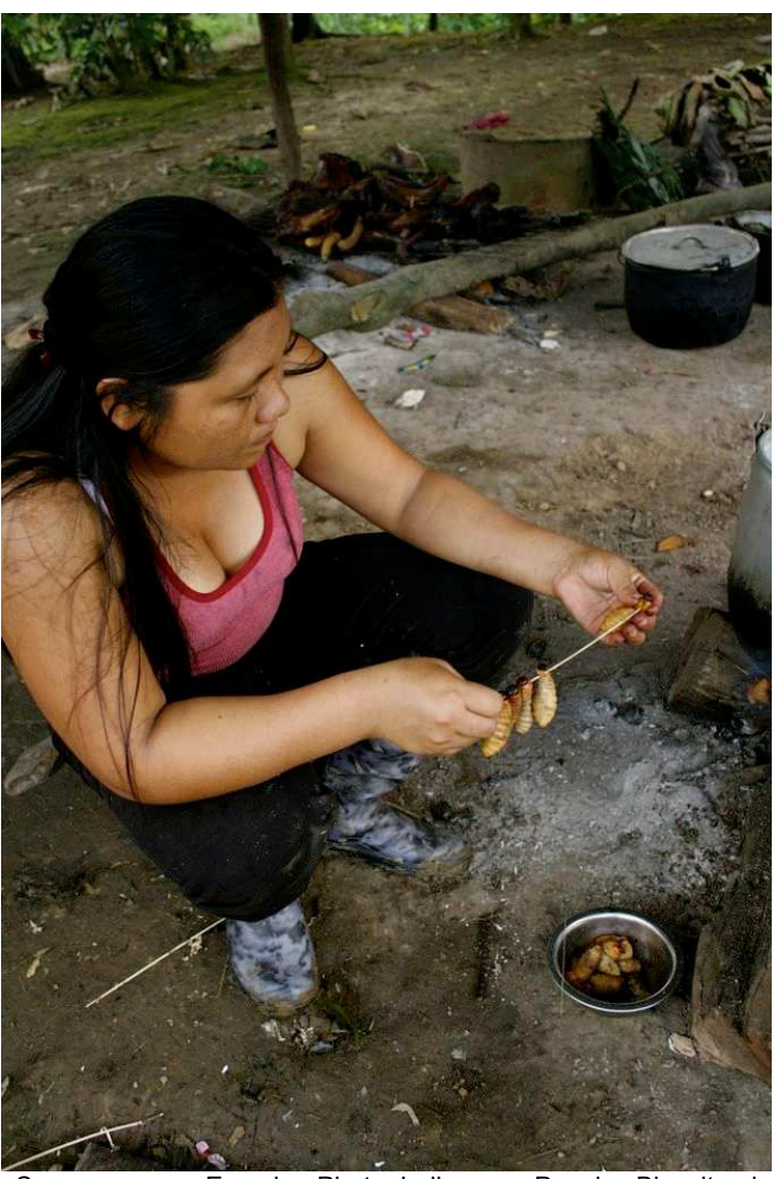
Sapara woman. Ecuador. Photo: Indigenous Peoples Biocultural Climate Change Initiative. See http://ipcca.info

Effective governance and respect for women's rights are key prerequisites that enable women to engage in these processes. A serious shift towards sustainable development requires gender equality and an end to persistent discrimination against women at all levels of biodiversity and cultural resources use.