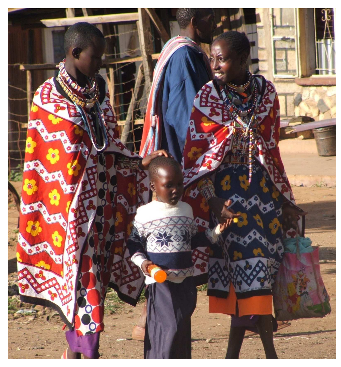
Maasai women, Kenya.

Opposition to technology evaluation can be expected from some industries and governments. Arguments against undertaking technology assessments historically revolve around protestations that the assessments are premature – or, alternatively, too late – are too costly, or are not worth the potential delay in commercial deployment or risk to competitive advantage. However, there is reluctant recognition from many parties, and within the UN, that 'business as usual' is not working. In the absence of any technology assessment mechanism to deal with intergovernmental concerns and transboundary issues, the UN has had no structural alternative but to adopt three moratoria related to new technologies since the beginning of the 21<sup>st</sup> century, namely, on GURTs (genetic use restriction technologies, or Terminator seeds) in 2000; on ocean fertilization in 2008; and a general moratorium on climate-related geoengineering in 2010, which was reaffirmed in 2012 – all under the aegis of the Convention on Biological Diversity (CBD).