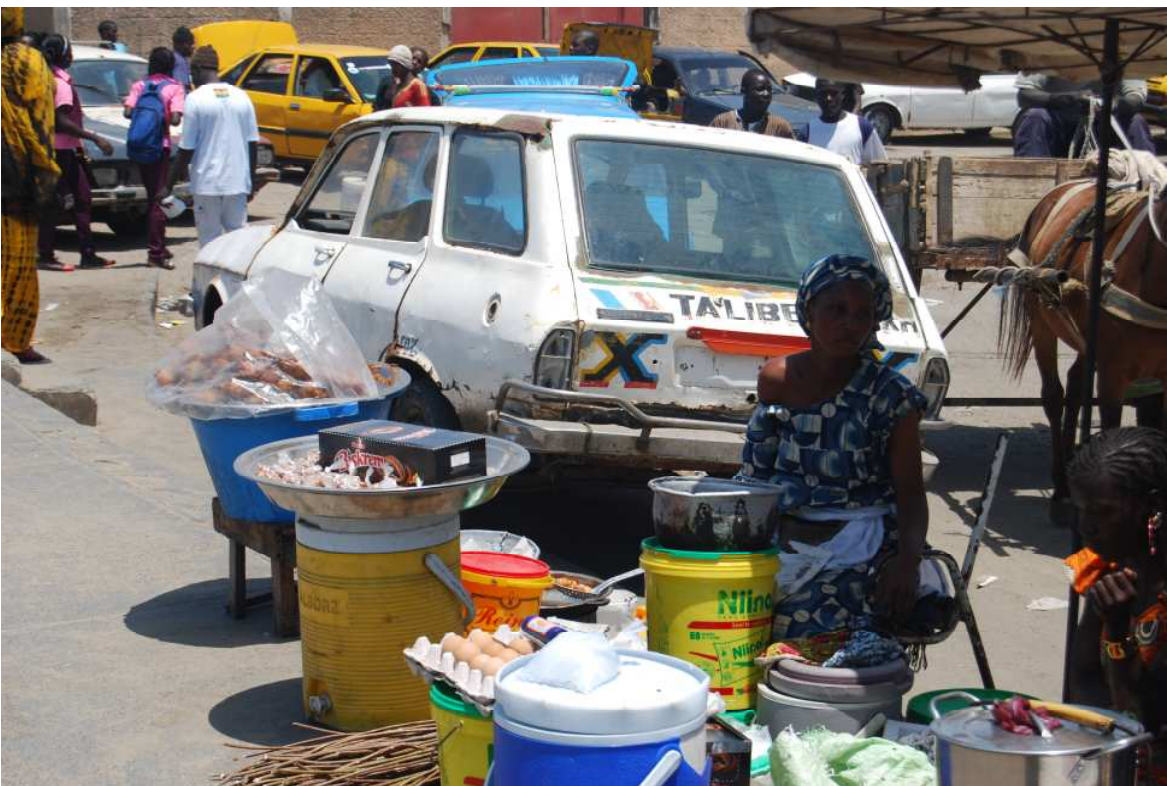
Saint Louis, Senegal.

It is clear that a full liberalisation of the agriculture sector through multiple mechanisms will reduce protection for women farmers and workers in developing countries. In addition, protective mechanisms such as sensitive products (using a gender criterion) and SSMs are being increasingly restricted. Women will also be hurt more as we liberalise investment, services, IP and public procurement. Their dependence on the resources threatened under these agreements is higher and their ability to shift out of agriculture is limited. Their role as food providers gets severely undermined not only by losses in production and livelihoods, but also from threats to natural resources, markets and technologies which are important for direct access to food as well as instruments for sustaining production and sales. Gender sensitivities need to be taken into account in all aspects of trade agreements, while combining it with gender friendly development policies.