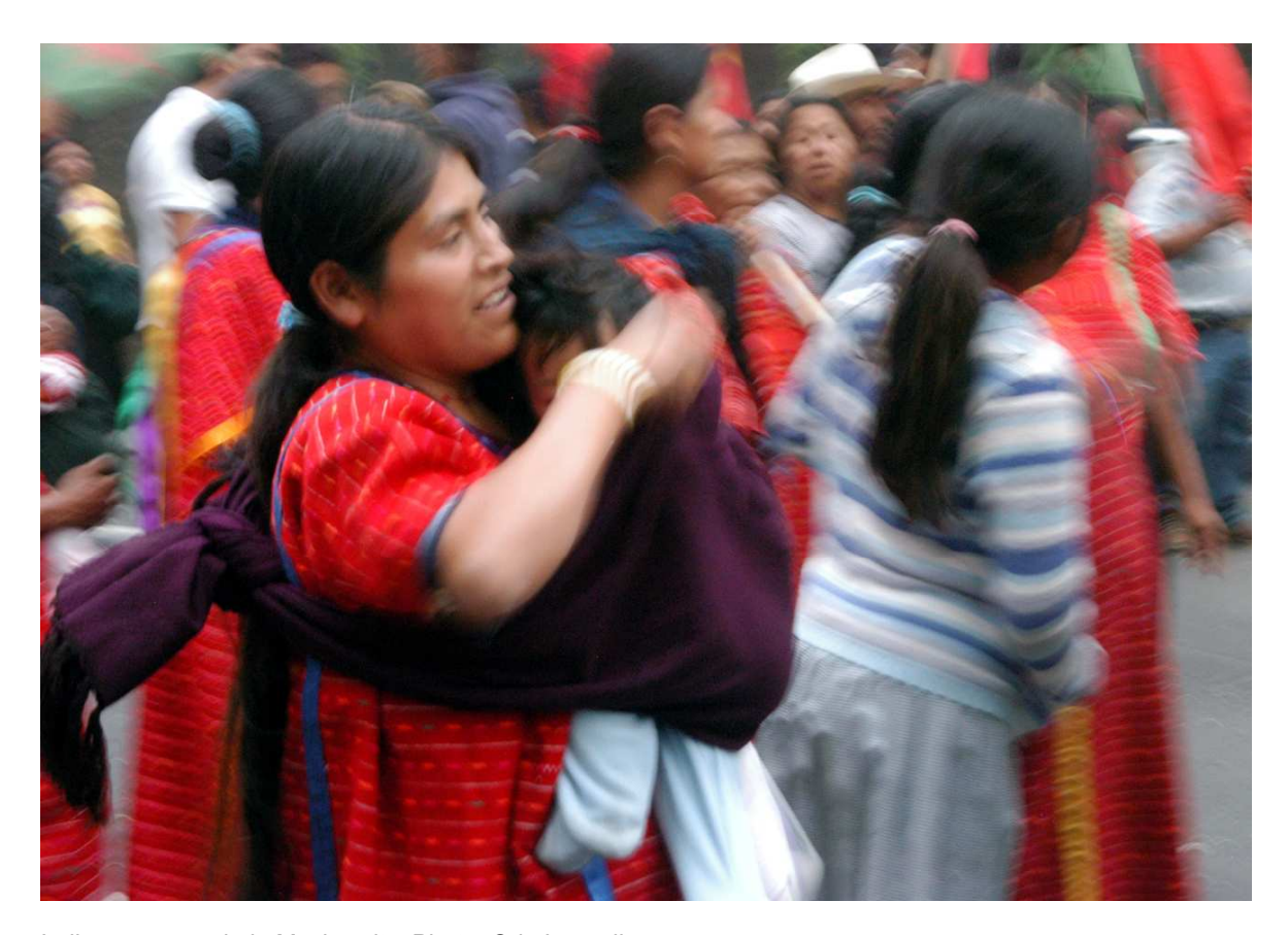
Indigenous people in Mexico city.

development agenda'. They also stated that all development proposals must be based firmly on non-regression and recognition of universally agreed human rights articulated through already agreed international law and agreements - not on notions of 'basic rights' and 'safety' that are hard to define and measure. <sup>293</sup>