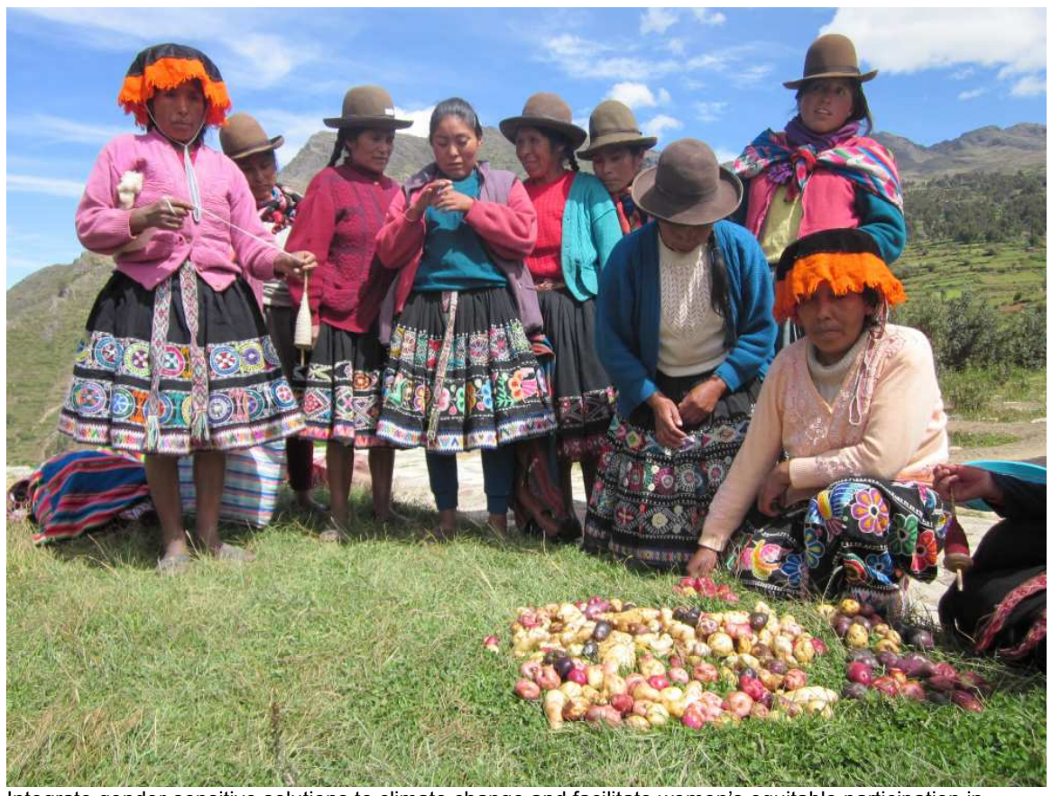
Integrate gender-sensitive solutions to climate change and facilitate women's equitable participation in decision-making processes at all levels. See also: http://ipcca.info

\underline{\text{https://docs.google.com/gview?url=http://sustainabledevelopment.un.org/content/documents/327brief6}.pdf\&embedded=true