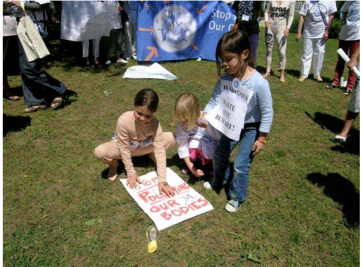
"Stop polluting our children's bodies". Creating a better health and environmental protection for children. Protest by parents and Children during the Children's Environment and Health Plan for Europe Conference in Hungary, Photo WECF/WICF

use of inferior fuels for cooking and space heating in developing countries. The following sections will explore them in some detail.