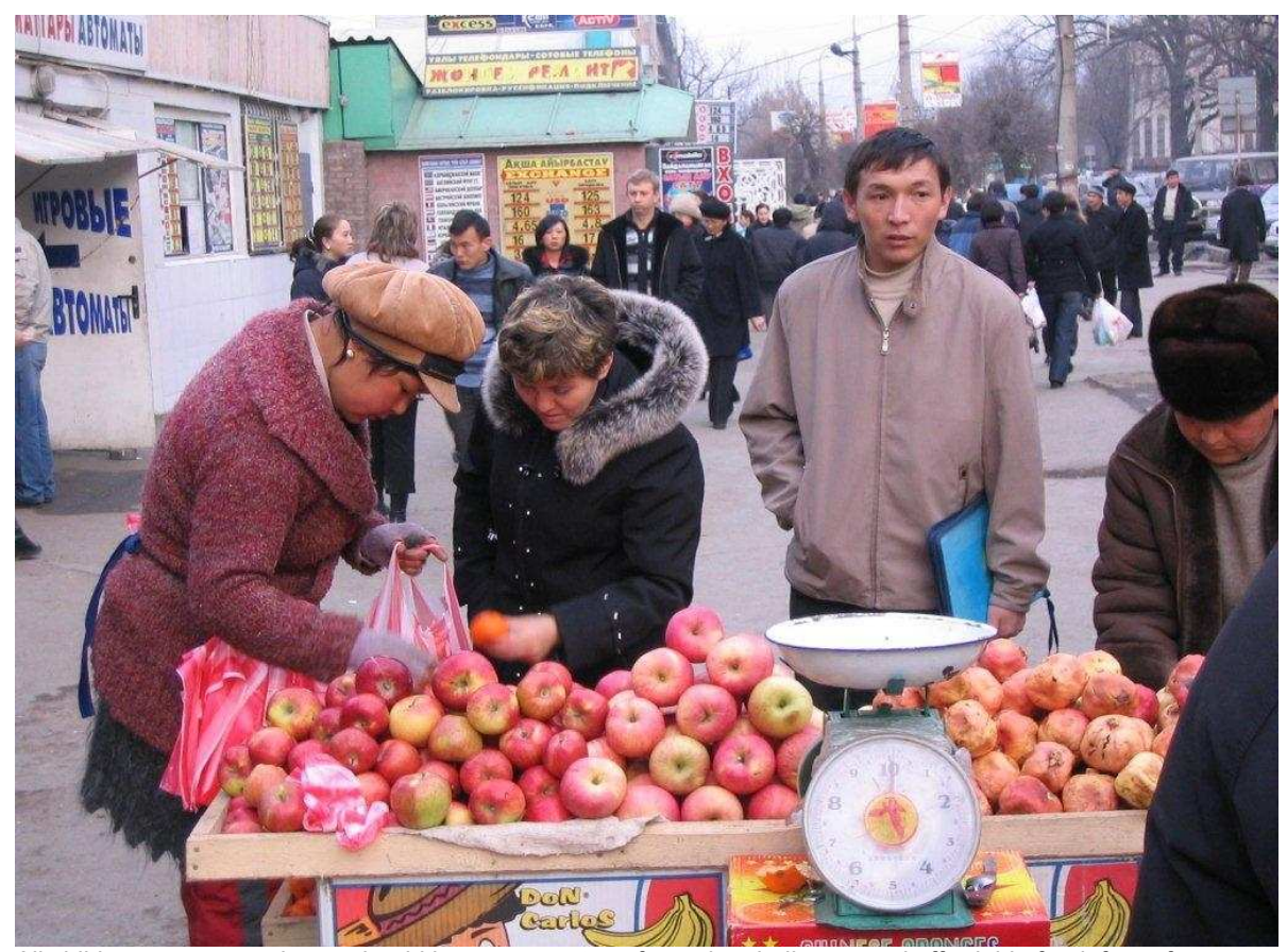
All children, women and men should have access to safe, regional, diverse and affordable food, free of hazardous chemicals and GMOs, based on fair trade and produced in harmony with nature and landscape, protecting water, soil, air and biodiversity.

In an increasingly globalised world, the impact of trade and investment liberalisation is an important area of policy focus. In the current context, the gender impact of trade policy must be paid serious attention especially as it is increasingly evident that trade policy is not 'gender neutral'. This is because women's economic and social positions are weaker, their rights are not well defined and a harshly competitive system hurts the weakest the most. The impact on women is partly general<sup>273</sup> and partly gender specific, determined by the way they are integrated into specific sectors.