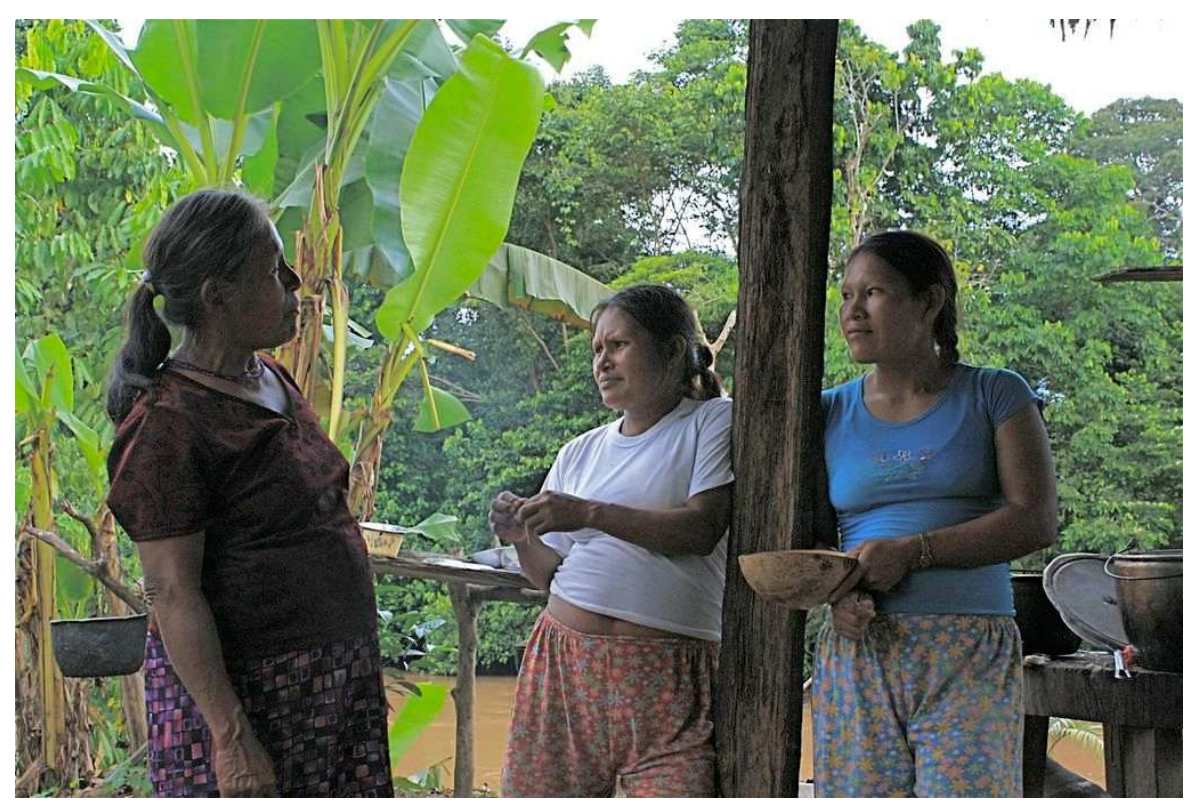
Sapara women, Ecuador. Photo: Indigenous Peoples Biocultural Climate Change Initiative. See http://ipcca.info

Women's are preservers of seeds, of traditional systems of cultivation, of biodiversity as they depend more on these traditional systems and also help to nurture their diversity. These are under threat from the current IPR systems. Even the way traditional knowledge is currently being 'protected' by the mainstream approach actually either takes access away from communities, or lures them into the IPR system in the name of rights, reward or recognition. The IPR system is inadequate to deal with people's knowledge systems, which neither privatised the knowledge nor were based on individual inventorship. For most local groups and women their know-how of the living world is intellectual heritage and not intellectual property. Despite what is said globally and nationally about patents, plant variety protection, geographical indications, etc. mere accommodating women within them does not effect real justice to them. For example, the relation of India's Biological Diversity Act with these IPR laws has to be critically viewed, as this conservation law is also fast becoming a venue to approve IPR applications on India's biological resources and related knowledge.