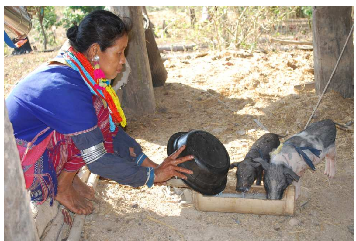
Thai daily life. Feeding the animals. Thailand. Photo: Indigenous Peoples Biocultural Climate Change Initiative. See http://ipcca.info