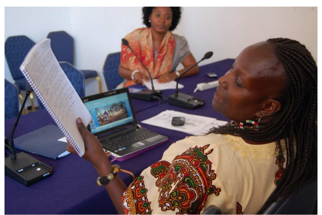
Women delegates to the UNFCCC in a learning exchange, Cancun, Mexico, 2010.

Achieving gender equality is intrinsic to the advancement of human rights. Women's rights are human rights and must be respected, promoted and protected by all actors in all sectors. Neither gender equality nor human rights can be separated from sustainable development, which has interlinked social, economic and environmental dimensions. Gender equality is a driver of sustainable development – and sustainable development should be a driver of gender equality.