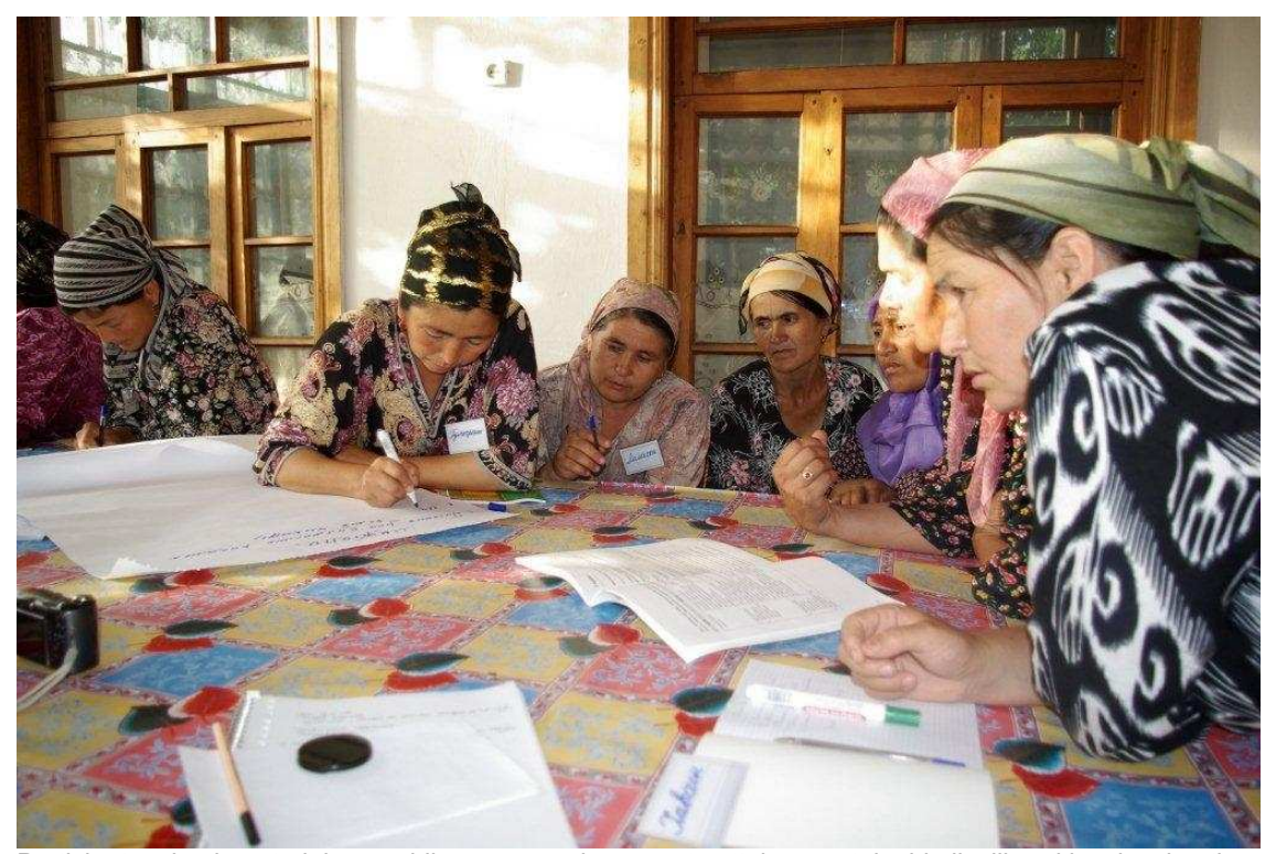
Participatory hygiene training enabling poor rural women to attain a sustainable livelihood by showing them ways of improving their living health conditions.

The Women's Major Group (WMG) is organized globally with over 390 representatives of non-governmental organizations. Two organizing partners (Women International for a Common Future, WICF, and Development Alternatives with Women for a New Era, DAWN) and two core group members (Women's Environment and Development Organization, WEDO, and Global Forest Coalition, GFC) coordinate the WMG<sup>1</sup>.