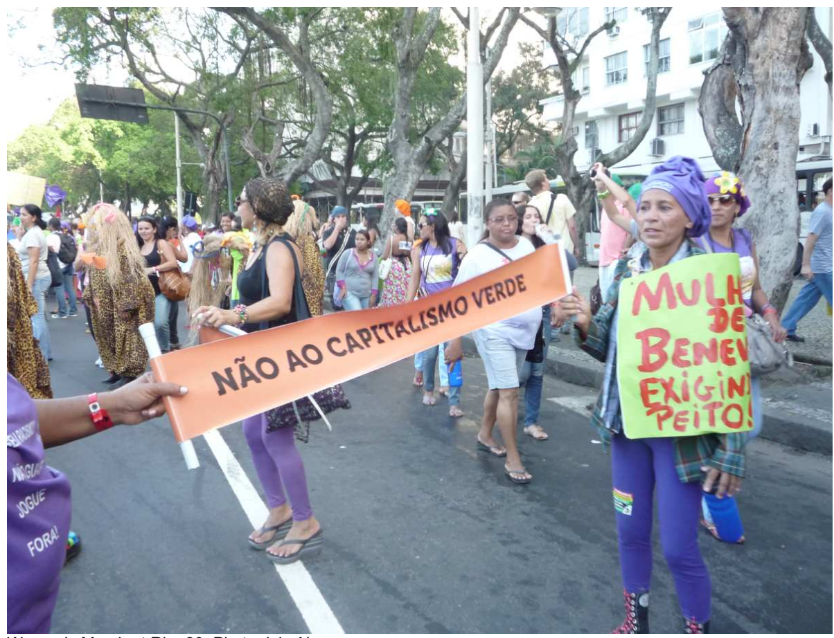
Women's March at Rio+20.

predict with certainty which commodities or workers will be affected and how quickly. However, if a new nano-engineered material or a new bioproduct created using synthetic biology equals or outperforms a conventional commodity and can be produced at a comparable cost, it is likely to replace the conventional commodity. Modern history is replete with examples of new technological products and processes replacing traditional commodities, causing massive displacements in livelihood and employment. 314