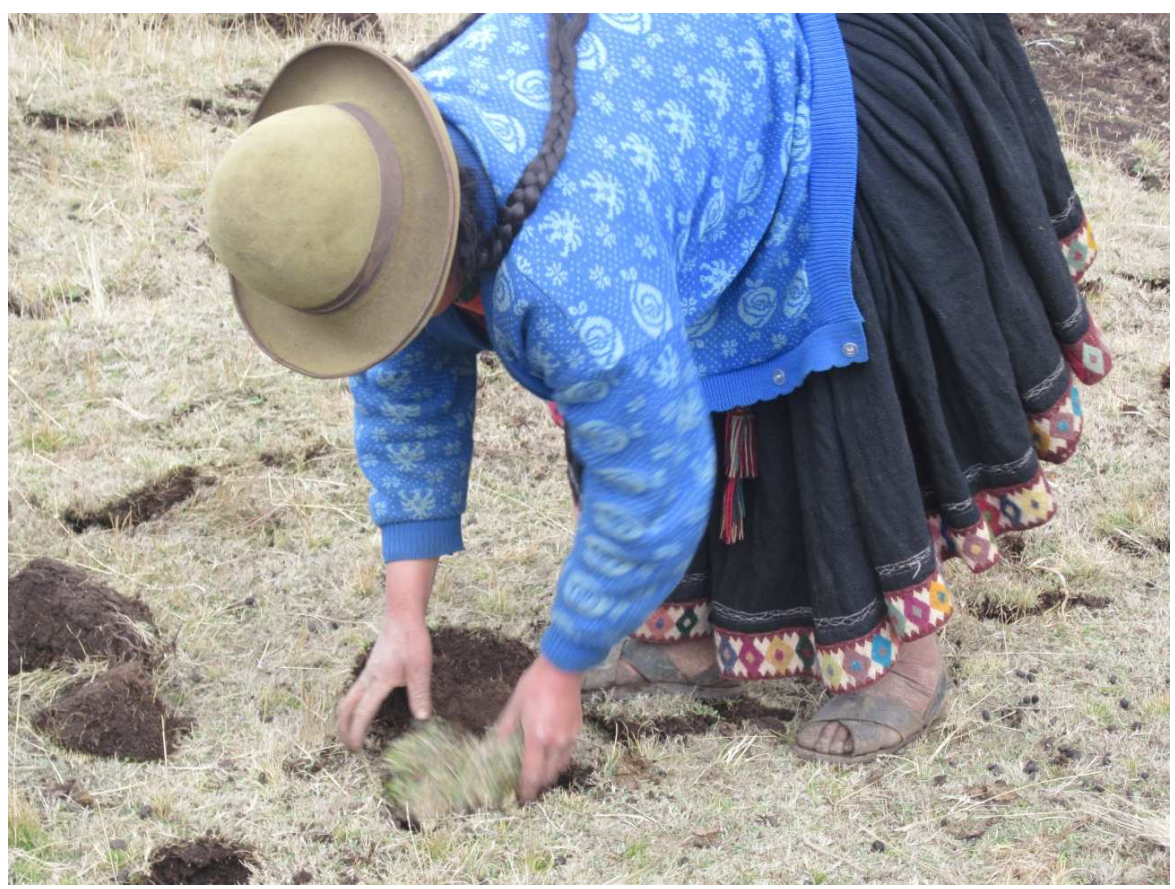
Female farmers in the ANDES. See also http://ipcca.info

According to ILO, the Decent Work Agenda should have four strategic objectives, with gender equality as a cross-cutting objective. These objectives are: creating jobs (generating opportunities for investment, entrepreneurship, skills development, job creation and sustainable livelihoods); guaranteeing rights at work (including workers' representation and participation); extending social protection (guaranteeing a minimum living wage, safe working conditions, and essential social security to all in need) and promoting social dialogue (through workers' and employers' organizations' effective participation).