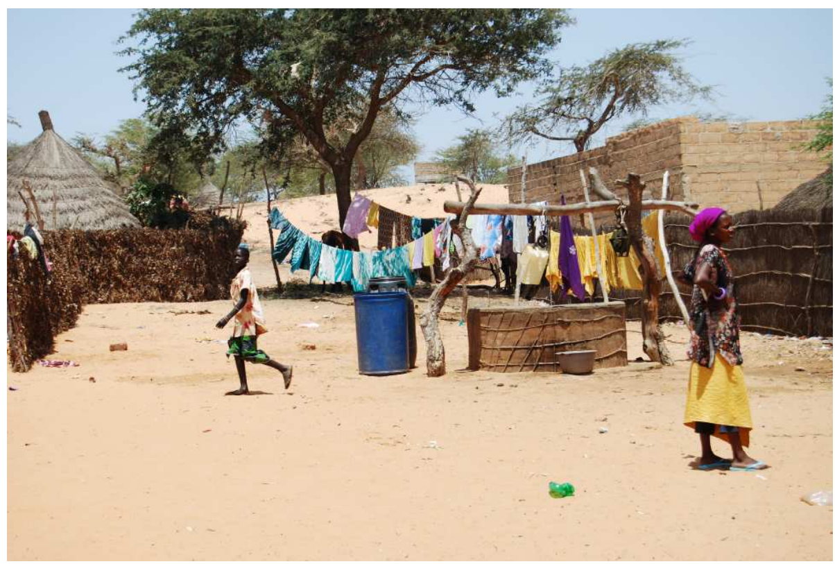
Recognise ecological limits to the 'growth' paradigm. Senegal.

This chapter is therefore merely catalytic in nature, taking an urgent discussion forward in at least two ways: Firstly highlighting how some feminist and women's groups, civil society movements and south states are tackling conceptual, technical and political concerns, strategies and recommendations related to extractivism; Secondly, raising questions on how to advance long-fought gender equality and universal human rights, social and economic justice in this necessary but often cooptive global focus on economic and ecological sustainability.