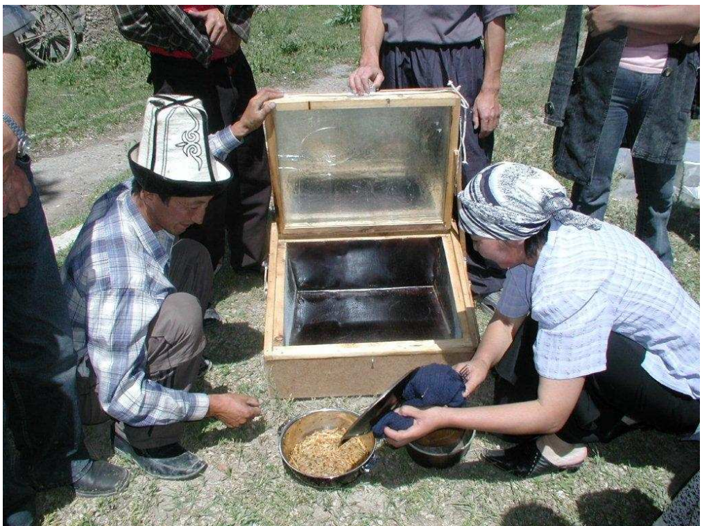
Demonstrating affordable and sustainable ways towards improved living conditions in rural areas of Kyrgyzstan, Photo: WECF/WICF